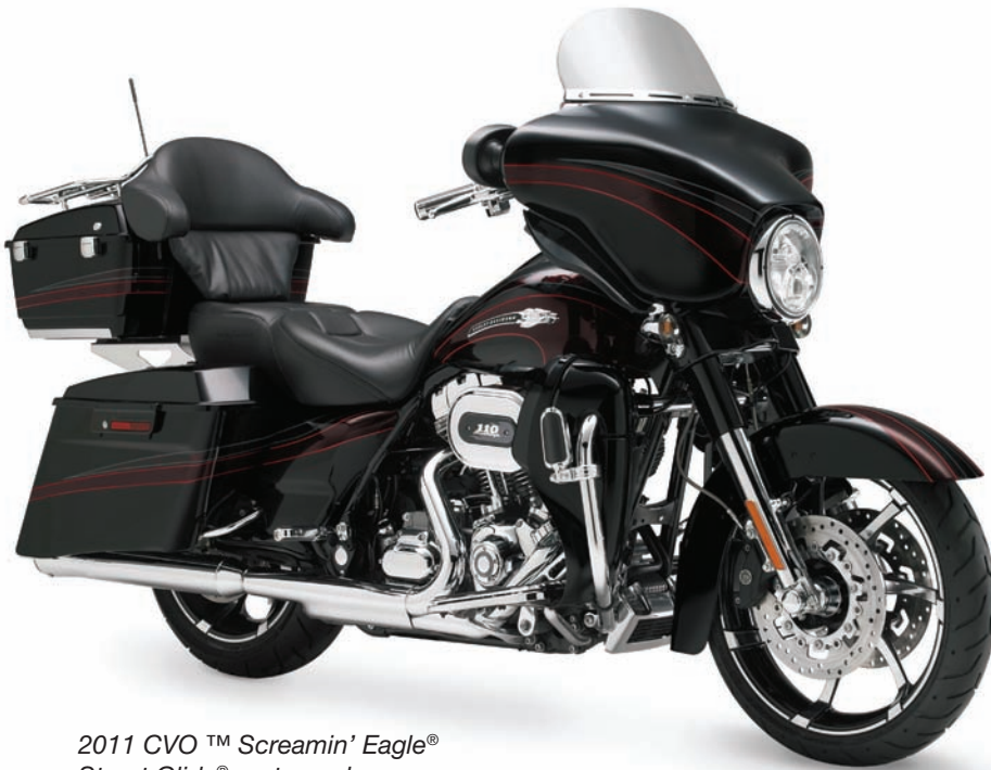
2011 CVO™ Screamin' Eagle® Street Glide® motorcycle

A s a Harley® motorcycle rider and H.O.G.® member, you're already the envy of all your non-riding friends. Now here's your chance to be the envy of your fellow H.O.G. members, too – by owning the motorcycle that Willie G. Davidson rode to Daytona Bike Week in 2011. When you join or renew your membership to the Harley-Davidson Museum® between November 1, 2011 and June 30, 2012, you'll be automatically entered in a sweepstakes to win his 2011 CVO™ (Custom Vehicle Operations™) Screamin' Eagle® Street Glide®!